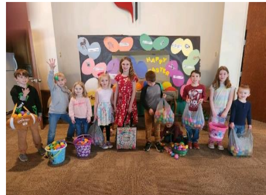
Figure 2 2024 Easter Egg Hunt

Noisy Change offering and KFC kids singing- April 7 Christian Skate Night- meet at the church at 5:30-April 8 High School YF- Bingo with residents at Willowbrook -April 14 YF is planning a Birthday party for some very special church members. The invitations will go out near the end of the month. All church members keep June 2 open for a potluck after Sunday School. College Scholarship Applications are available in the office. Turn them in between April 1 & May 31.