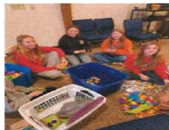
Figure 3 & 4 -Sr. High YF stuffing Easter eggs