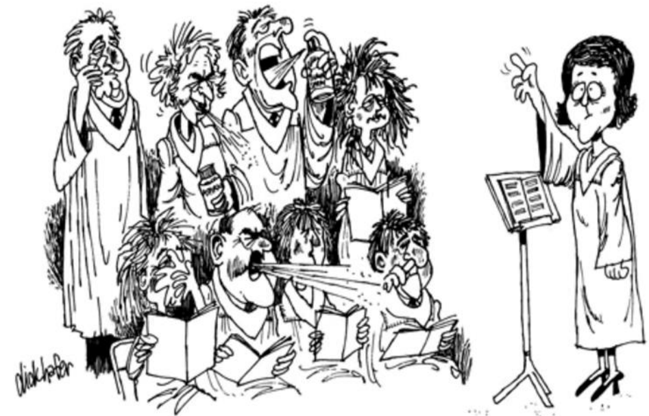
A PARTICULARLY BAD EASTER SUNDAY MORNING IN THE CHOIR REHEARSAL ROOM.