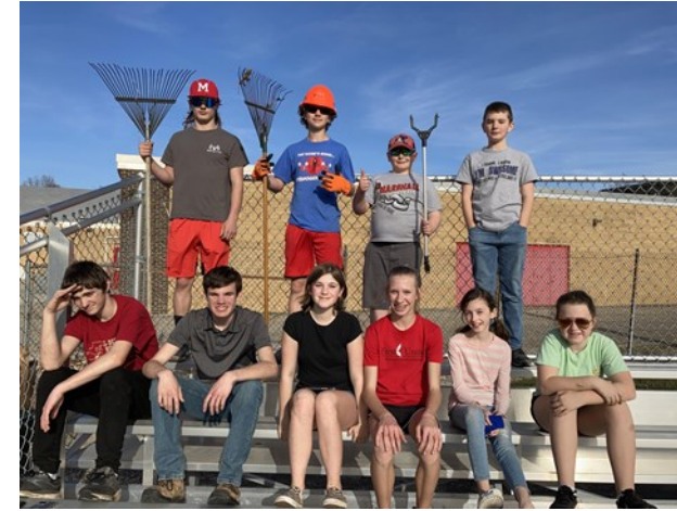
"In March, the UMYF students spent one Sunday afternoon cleaning up trash and leaves from the high school track."