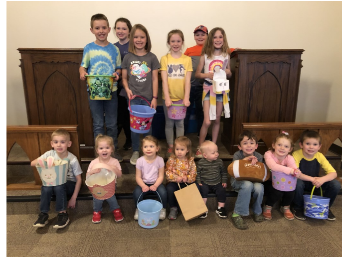
Our children enjoyed the annual Easter egg hunt last month.