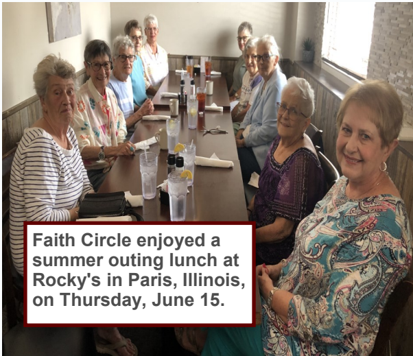
Faith Circle enjoyed a summer outing lunch at Rocky's in Paris, Illinois, on Thursday, June 15.