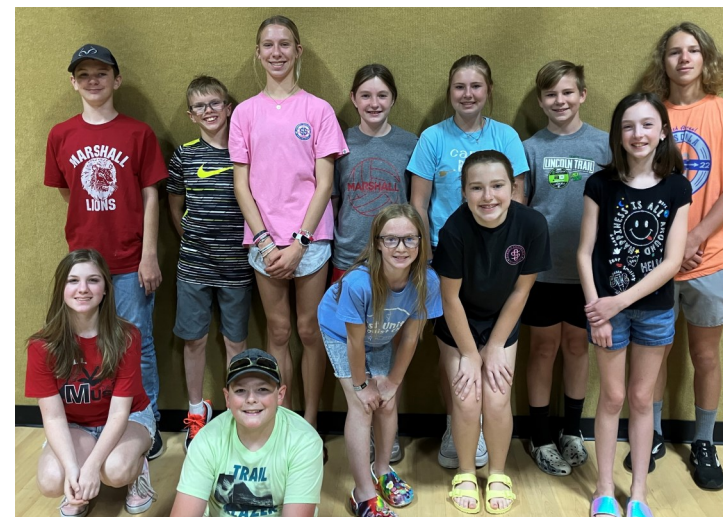
Some of our youth helped back bags for the Summer Lunch Program.

We will also need volunteers during the day to help supervise, cook, clean up, and more. If you are interested in helping, please let James know.