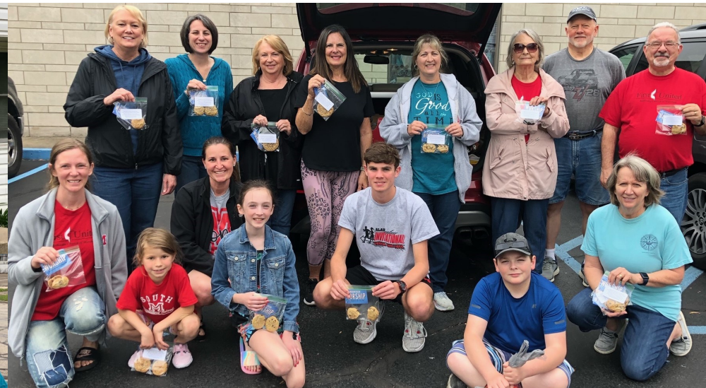
Mother/Daughter/Friend Dinner, May 13th