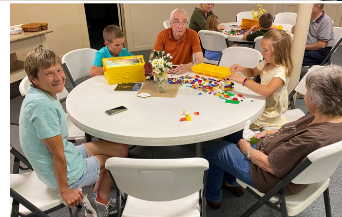
Our pen pals, both young and experienced, recently enjoyed an evening filled with food, fellowship, and fun.