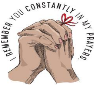
2 TIMOTHY 1:3. ESV